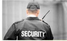
24 HOURS SECURITY