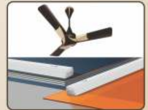
LIGHT / FAN